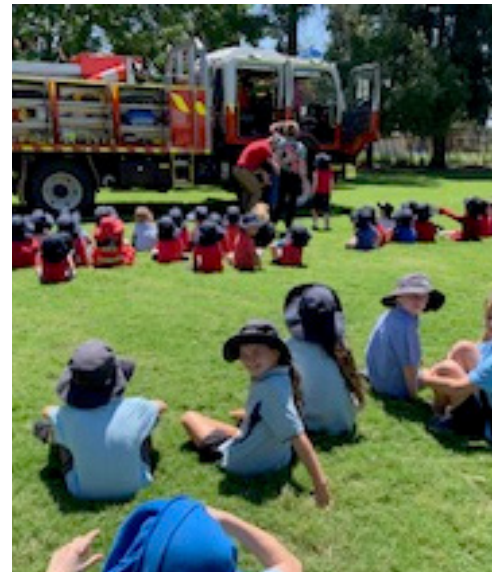
We are doing Maths outside.....

And a fire truck came to school.... Stay tuned to see what else is in store for 5A!!