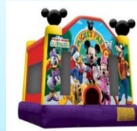
Wanna Jump - Jumping Castles

WANNA JUMP JUMPING CASTLES Hire a Jumping Castle for your next event.