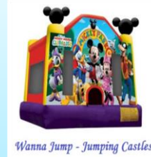
Wanna Jump - Jumping Castles

WANNA JUMP JUMPING CASTLES Hire a Jumping Castle for your next event. Business Promotions Ph: 0407 745 100