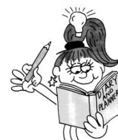
Get Yourself Organised