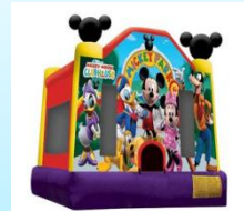
Wanna Jump - Jumping Castles

Facials, Waxing, Massage, Manicures Body Wraps, Tinting, Pedicures (02) 6374 2445 Tallawang St, Gulgong, NSW, 2852