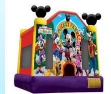
Wanna Jump - Jumping Castles

Facials, Waxing, Massage, Manicures Body Wraps, Tinting, Pedicures (02) 6374 2445 Tallawang St, Gulgong, NSW, 2852