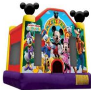
Wanna Jump - Jumping Castles

Hire a Jumping Castle for your next event. Business Promotions Ph: 0407 745 100